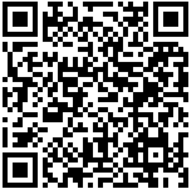
Network Survey Link