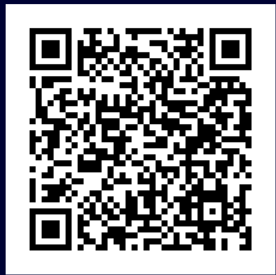
Complete the survey